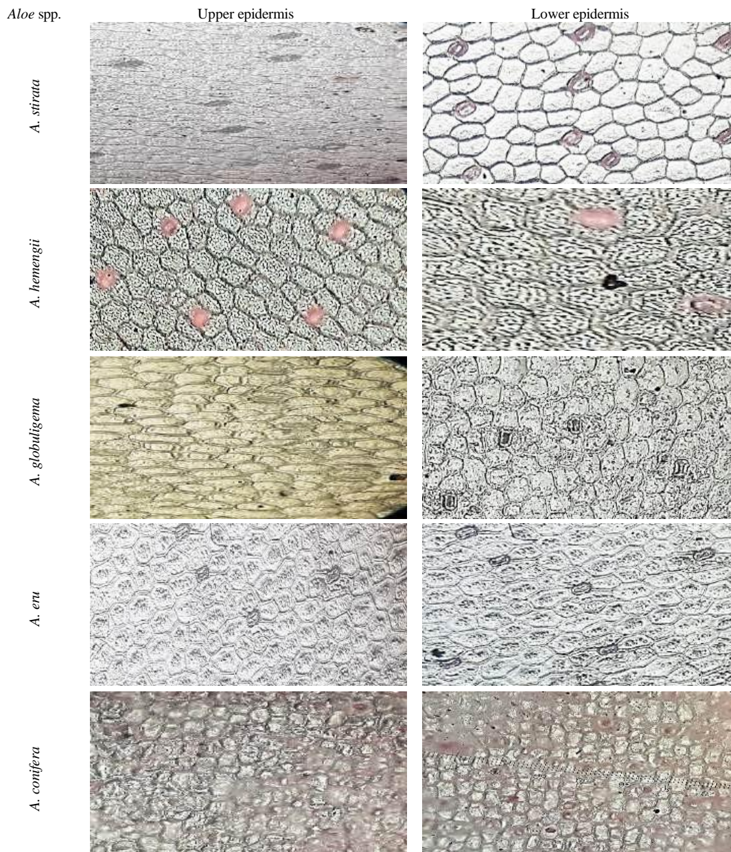
Fig. 3: Anatomical variations in stomatal density and index of different Aloe species ( A. hemengii , A. globuligema , A. eru and A. confiera )