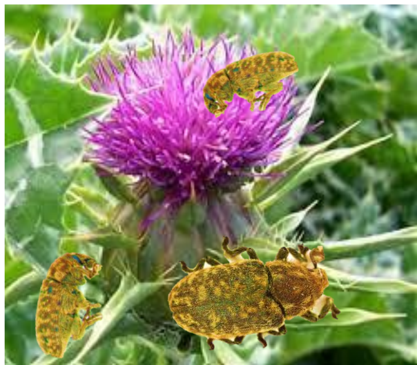
Fig. 3: Rhinocyllus conicus attack on milk thistle

larvae, which increases milk thistle vigor and germination (Gabay et al. 1994).