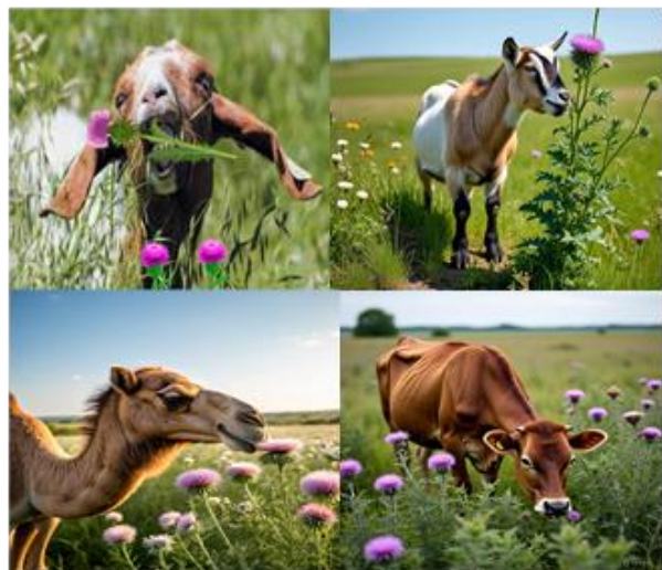
Fig. 4: Animal attack on milk thistle

1991). Vinograd et al. (2011) reported that in Israel, milk thistle is a dominant weed and cannot be grazed by sheep and goats.