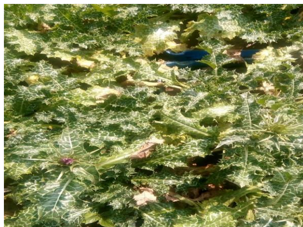
Fig. 2: Milk thistle necrosis under salinity stress

21–27°C were effective in enhancing germination percentage. Heidari et al. (2014) used three varieties of milk thistle to confirm cardinal temperatures related to germination response. They concluded that varietal and temperature differences are of prime importance, especially regarding germination rate, reciprocal time to 50% germination, germination uniformity, germination percentage, and time to 5, 10, 50, 90, and 95% germination. They suggested that the optimum temperature for milk thistle growth is 28–29.5°C.