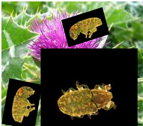
Fig. 3: Rhinocyllus conicus attack on milk thistle

larvae, which increases milk thistle vigor and germination (Gabay et al. 1994).