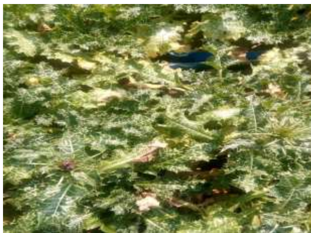
Fig. 2: Milk thistle necrosis under salinity stress

21–27°C were effective in enhancing germination percentage. Heidari et al. (2014) used three varieties of milk thistle to confirm cardinal temperatures related to germination response. They concluded that varietal and temperature differences are of prime importance, especially regarding germination rate, reciprocal time to 50% germination, germination uniformity, germination percentage, and time to 5, 10, 50, 90, and 95% germination. They suggested that the optimum temperature for milk thistle growth is 28–29.5°C.