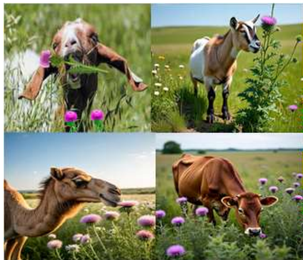
Fig. 4: Animal attack on milk thistle

1991). Vinograd et al. (2011) reported that in Israel, milk thistle is a dominant weed and cannot be grazed by sheep and goats.