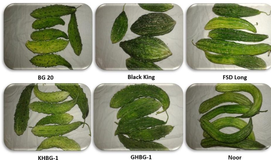
Fig. 1: Fruits of different cultivars of bitter gourd used in this study