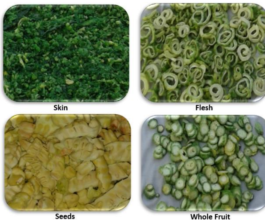
Fig. 2: Fruit and its components

determine presence of crude protein (%) based on the N content of the sample: